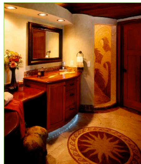
Residential Grand Prize Winner

Contractor: New Era Tile & Stone San Diego, Calif.