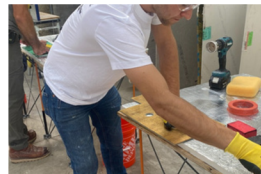
Safety on the Job Site