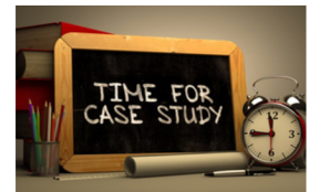
TileLetter Portfolio - A Case Study Issue