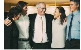
Tile: The Next Generation