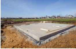
Laying the Foundation for Success