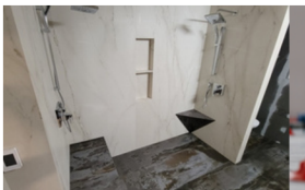
Specialized Installation Procedures