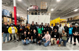
The Training Issue